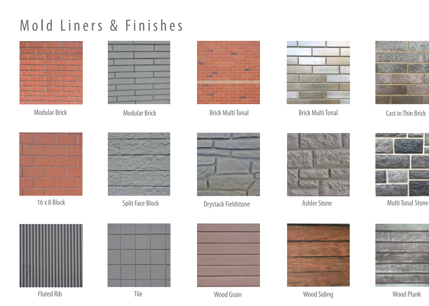
Additional colours and finishes available! Please contact us for your full guide.